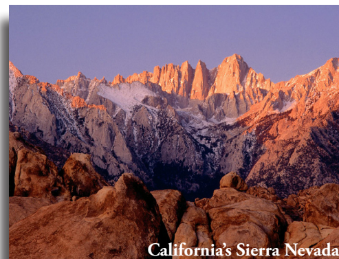
California's Sierra Nevada

Following an included breakfast this morning we continue south on Highway 395 with a lunch stop and more sightseeing enroute. Later this evening we arrive back at our drop-off points. We'll have many new memories and photos of the spectacular geologic phenomena and a new appreciation of Mother Earth and her mysterious ways. (Breakfast)