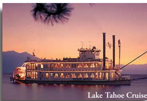
Lake Tahoe Cruise