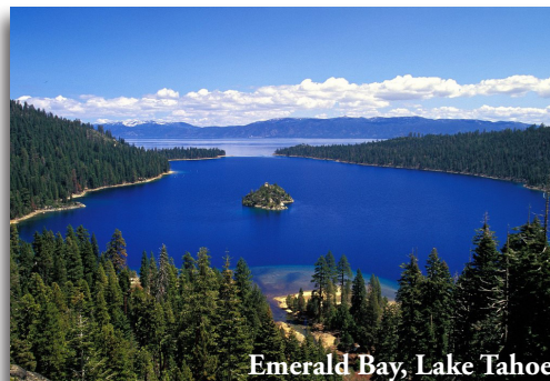
Emerald Bay, Lake Tahoe